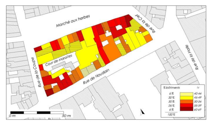
Figure 3 – Determination of the vulnerability index Vi in a part of the historical centre of Mons [5]

considers 11 parameters fundamental for the building resistance to earthquakes, as the ceiling rigidity or the state of the construction. These parameters come from the Italian experience [6] and are based on the inventory of damages observed during past earthquakes. They have been adapted to the characteristics of the Belgian framing. In a first step, a basic vulnerability index (Vi) is determined based on the typologies of a building. In a second step, particular characteristics not always observable from outside of the buildings have been investigated. The sum of the basic index and the penalties based on those particular characteristics is then calculated to estimate the vulnerability index. The analysis in a district of the historical centre of Mons is shown in Figure 3.