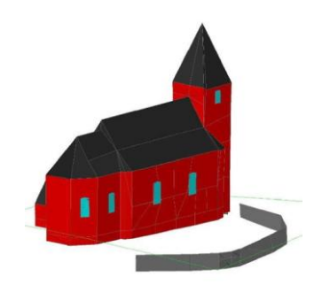
Figure 5 – Typological study [10]

The typological study allow us to list the characteristics of vulnerability to earthquakes as the thickness of walls, the asymmetry in plane and elevation, the simplicity of form of the building, the recess or projection of parts of buildings ... In the case of the church of Petit-Hallet, we conducted a specific analysis to identify the major part of these characteristics of vulnerability (figure 5).