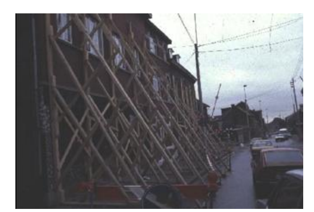
Figure 1 – Consequences of the Liège earthquake on November 8, 1983 (M = 4.7)

Seismic Risk 2008 - Earthquakes in North-Western Europe